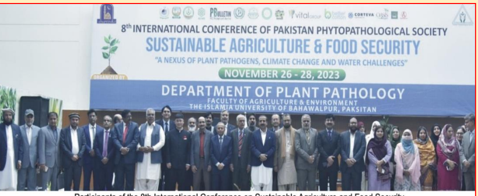
Participants of the 8th International Conference on Sustainable Agriculture and Food Security organized by the Department of Plant Pathology, Faculty of Agriculture and Environment, the Islamia University of Bahawalpur

Pakistan Phytopathological Society organized the 8<sup>th</sup> International Conference "Sustainable Agriculture and Food Security" during 26-28 November, 2023 in collaboration with Directorate of Public Relations, Islamia University Bahawalpu,r Department of Plant Pathology, Faculty of Agriculture and Environment and Australian Center for International Agricultural Research. The conference was held at Baghdad ul-Jadeed Campus of Islamia University of Bahawalpur, Punjab, Pakistan.